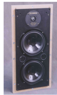
Inwall 120 W10.4"xD4.0"xH21.9" $1699/pair