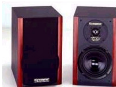
SILVERLINE 60 Mini Monitor H11.5 x W 7.5" x D 10.5" $849/pair

Optional matching black with red mahogany spiked stands available