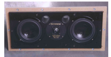
Silverline Inwall Center SLC 150 W19.3"x D3.6"x H8.9" $549 each

In the picture of the Silverline 60 Inwall (above left) - What you see on your wall is a white painted wooden frame with textile. When you cut a hole into your drywall to install an Inwall speaker, the stability of the wall reduces correspondingly; rattling and distortion is the result. The patent pending MDF Kirksaeter Inwall System is the only Inwall speaker system that restores and improves the strength of your drywall, making it stronger and airtight. These systems improve the deep bass response substantially and eliminate the distortion. Therefore, Kirksaeter Silverline Inwall models sound just as excellent as the cabinet version of the same speaker. Look up the model pages and learn how anybody can install the KIRKSAETER Inwalls and tune them acoustically correct in less than 20 minutes!