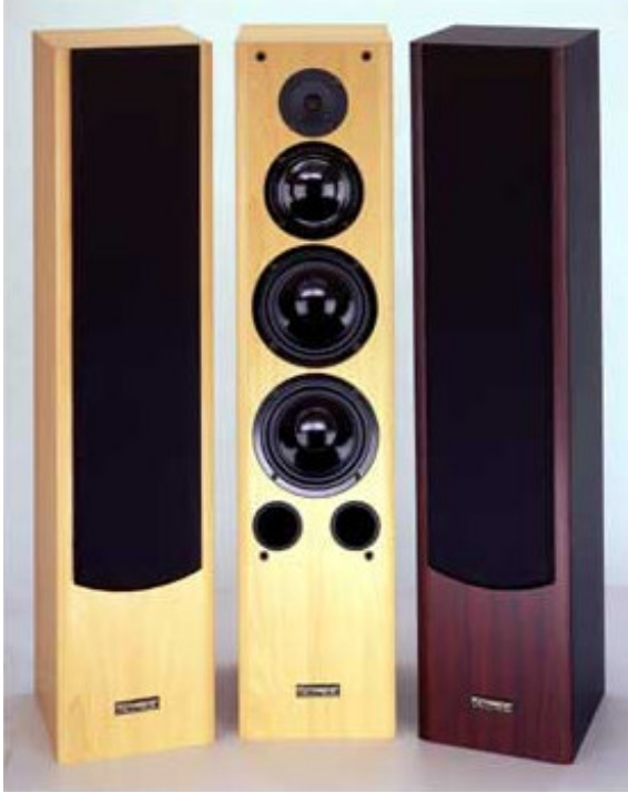
PRISMA 210 Tower , several finishes Height 41.5 X W9.25" x D10.5" $ 1599 a pair

Prisma is a line of speakers that has received many accolades from being the Best Buy, to being elected as the Loud-Speaker of the Year in Norway. We have set our highest priority to using parts and features that have a strong positive influence to the sound quality, and we have left out less important features that substantially increase the price.