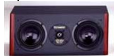
SILVERLINE Center 150 SLC H7.9" x W 18.2" x D 7.1" $549 each

This Center speaker is for use in a Home Theatre installation near to the TV to fill the sound hole between the two front speakers. All driver elements are magnetic shielded to protect your TV.