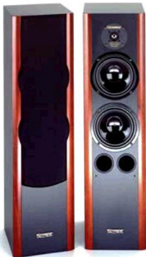
SILVERLINE 120 Black/solid Mahogany Height 35,5" x W 9,25" x D 10,5" $ 1,699/pair