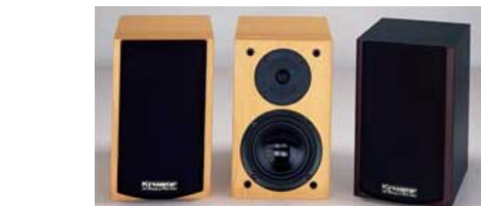
PRISMA 55 Mini Bookshelf , available in several finishes. Height 11.5" x W 7.1" x D "9.1 $ 559.00 a pair