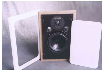
Silverline Inwall 90 H15.6" xD3.0" x W10.4" $1199/pair