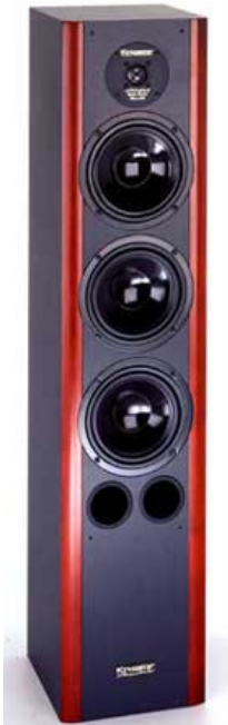
SILVERLINE 220 Black/solid Mahogany Height 49" x W 9.25" x D 10.5" $ 2,299/pair

Enthusiasts often invest in high quality cables. The cables inside the SILVERLINE become very important. Therefore, we use gold-plated biwiring terminals and the finest silver-plated cables, made in Switzerland, with up to 511 silver plated threads spun into one single lead. No music details or dynamics are lost. The consumer does not need to think about an expensive re-cabling of his Silverline.