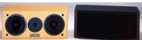
PRISMA Center speaker 105 Height 7.9" x W 18.2" x D 7.1" $ 369.00 each