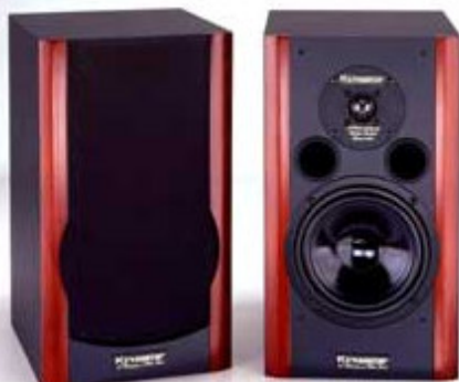
SILVERLINE 90 Monitor H16.5" x W 9,25" x D 10.5" $1199/pair

Optional matching black with red mahogany spiked stands available