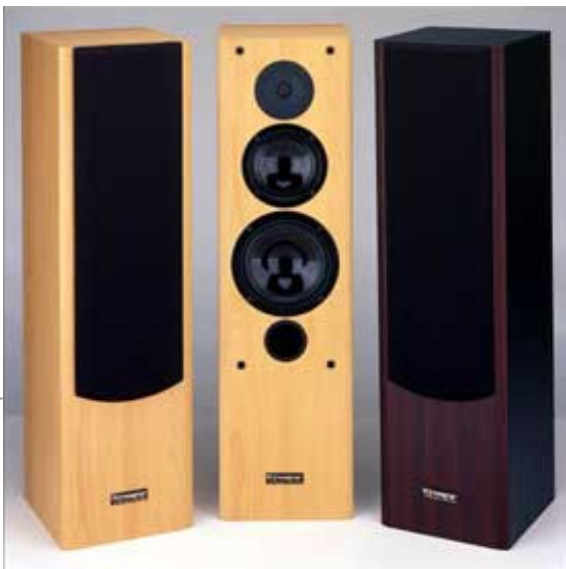
PRISMA 110 Tower , several finishes Height 33.6" x W9.25" x D10.25" $ 1099 a pair

Because PRISMA has a very high efficiency PRISMA draw less power from your amplifier than the most other speakers do. When electing PRISMA you should elect a model one number larger than estimated and the amplifier one number smaller than normal. Then you will have a system with the optimum value of your investment.